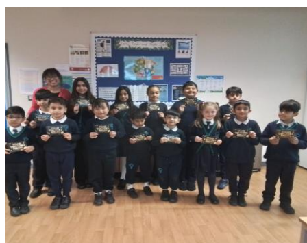
Attendance Winners for week beginning Monday 9th December 2024