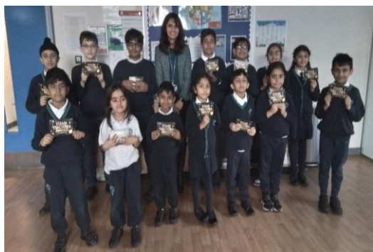
Attendance Winners for week beginning Monday 2nd December 2024