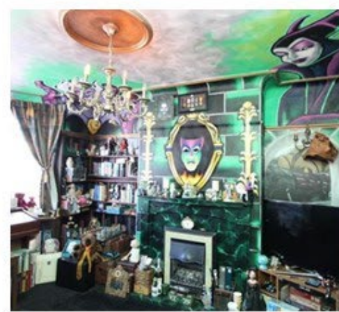
Pictured: The interior of the Disney themed house.