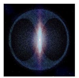
Pictured: Image showing the Oort Cloud.

The amazing A3 comet will be seen burning brightly across the sky this month! The Royal Greenwich Observatory are calling it 'the most impressive comet of the year!' Comet C/2023 A3 (Tsuchinshan-ATLAS) is predicted to be so bright, it will be visible to the naked eye. The best way to spot the A3 comet in the northern hemisphere is to look west just after