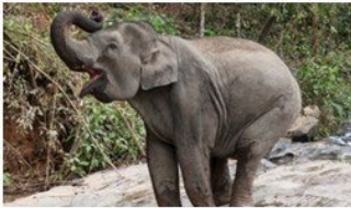
Pictured: Asian Elephant Trumpeting.