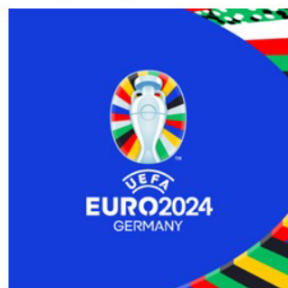
Pictured: Euros 24 logo.

win points. This is the group stage. The top two, or in some cases three, teams in each group will go on to the knockout stage – where only the winner of each match will go on to the next round. The final of the Euros is due to be played in Berlin on 14 th July. Who will you be supporting?