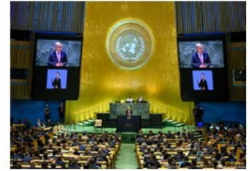
Pictured: Debating at UN Headquarters in New York, USA.

Leaders from around the world are meeting at the United Nations (UN) Headquarters in New York City, to talk about big problems facing the planet. The UN was created after World War II to help countries work together for peace, human rights, and helping people in need. Today, almost every country in the world is a member, and when issues or problems arise, the UN is one of the first places where countries share their concerns. This year, the UN will meet for the 79 th time! There are many important issues to discuss,