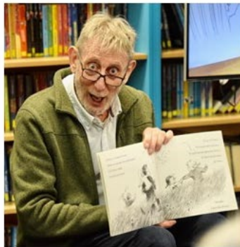
Pictured: Michael Rosen reading his famous story, We're Going on a Bear Hunt.

Words. He's excited to see young people enjoying stories and believes they're writing more than ever, through social media and texting. 'When I see children laugh and enjoy stories, it feels like magic,' he added.