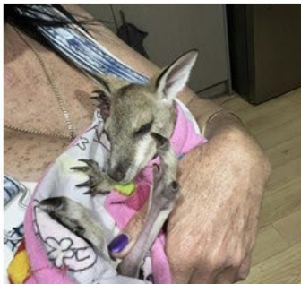
Pictured: Rescued Joeys being cared for at the centre.