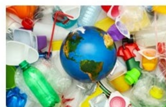
Pictured: Plastic waste.