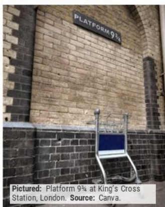
Pictured: Platform 9¾ at King's Cross Station, London.