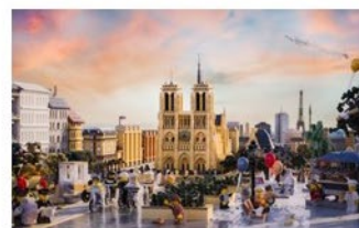
Pictured: A Lego scene of Notre Dame.

LEGO have announced that they will be making their bricks from 50% recycled plastic by 2026! They also said that this move is going to cost them more money because the renewable resin that they will use is 70% more expensive. LEGO don't want to pass the increase in price on to their customers. 'The costs of these materials will not be passed on to the consumers, it will be absorbed by the LEGO Group on our bottom line,' the company said. LEGO has set the target date of 2032 to reach a goal of using entirely renewable and recycled materials.