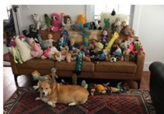
Pictured right: Coraline with some of her toys. Pictured above: Jesse and his 130 toys.