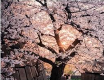
Pictured: Cherry blossom.

Trees and hedgerows are currently adorned with colourful blossom. Plants and trees that will go on to produce fruit, grow buds at first, which flower once warmer weather arrives in the spring. This is the blossom that we are seeing now. The flowers attract bees