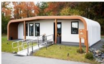
Pictured (Right): Factory of the Future 1.0. Pictured (Left): A home produced by the world's previous largest 3D printer.

Would you like to live in a home that has been created by a 3D printer?