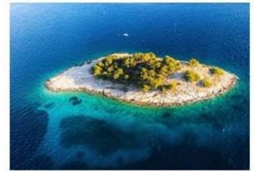
Pictured: Desert island.

Three sailors have been rescued from a remote Pacific island after being stranded there for a week following an accident involving their fishing boat. The fishermen's boat was struck by a large wave, damaging the outboard motor. When the mariners attempted to make contact with coastguards, they found their radio had run out of battery. Luckily, the men managed to swim to a small, nearby island called Pikelot Atoll, where they cleverly fashioned a 'help' sign using palm fronds. The search for the sailors began in early