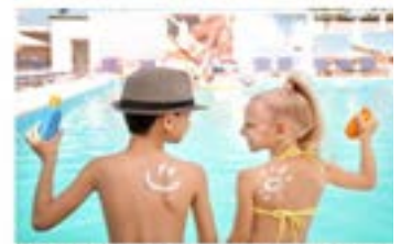
Pictured: Applying sun cream.

The sun is an essential part of life on Earth, providing light, warmth and energy. Sunlight can be good for humans, as it helps the body to produce vitamin D that keeps our bones strong, and it boosts our mood! However, it can also be harmful to our skin. Did you know that our skin is an organ? In fact, it is the largest organ in the human body! It acts as a barrier to protect the inside of our bodies from the outside world, so it is important that we take care of our skin. In the summer months, we can use sun cream to help protect our