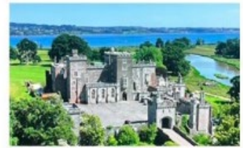
Pictured: Powderham Castle, Exeter.