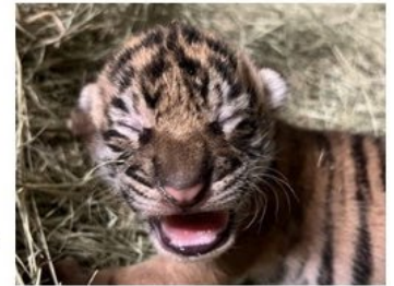
Picture: The Sumatran tiger cub at San Diego Zoo Safari Park.